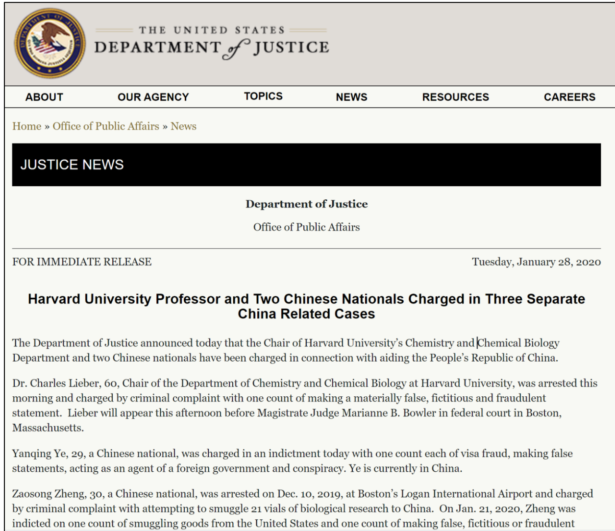
Figure 5: Press Release. (Jan. 28, 2020). Harvard University Professor and Two Chinese Nationals Charged in Three Separate China Related Cases. U.S. Department of Justice, accessed Sep. 14, 2021. Source: https://www.justice.gov/opa/pr/harvard-university-professor-and-two-chinese-nationals-charged-three-separate-china-related