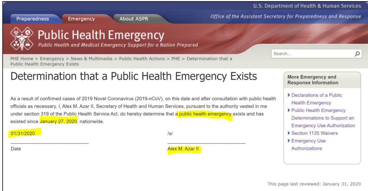
Figure 4: Alex M. Azar, II. (Jan. 31, 2020). Determination that a Public Health Emergency Exists. Accessed Sep. 14, 2021. PHE.gov, Office of the Assistant Secretary for Preparedness and Response, U.S. Department of Health & Human Services. Source: https://www.phe.gov/emergency/news/healthactions/phe/Pages/2019-nCoV.aspx

On Jan. 28, 2020, the federal government indicted Harvard/Chinese nano-biowarfare researcher Dr. Charles M. Lieber in Boston. Lieber holds 66 U.S. patents in nanotechnology, much of it funded by Dr. Anthony S. Fauci and the National Institute of Health (NIH) as well as Harvard, DARPA, MITRE Corporation, Air Force Office of Scientific Research and the Office of Naval Research (each patent delineates the federal agencies that funded Lieber in the "Government Interests" section).